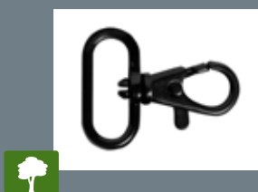
ECO-P1 Corn clip (100% biodegradable)