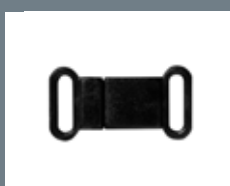
P13 Plastic breakaway