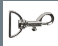
P4 Metal carbine hook