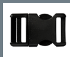
P11 Plastic buckle