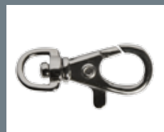
P7 Metal carbine hook