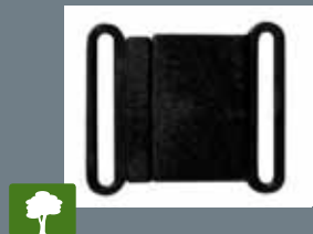
ECO-P2 Corn breakaway (100% biodegradable)