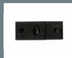
P12 Plastic breakaway