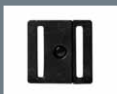
P14 Plastic breakaway