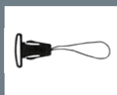
P15 Mobile phone holder