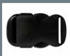
P10 Plastic buckle