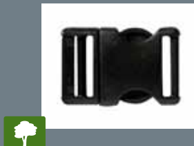
ECO-P3 Corn buckle (100% biodegradable)