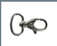
P5 Metal carbine hook