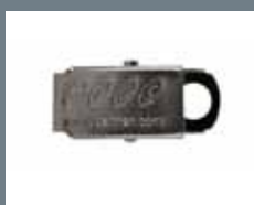
P9 Metal clip